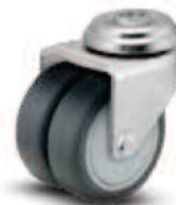
HOLLOW KINGPIN MODEL