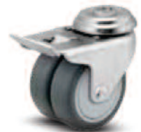
HOLLOW KINGPIN TOTAL LOCK MODEL