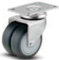
TOP PLATE SWIVEL MODEL