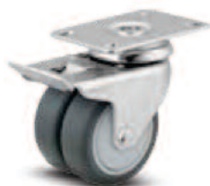
TOP PLATE SWIVEL TOTAL LOCK MODEL